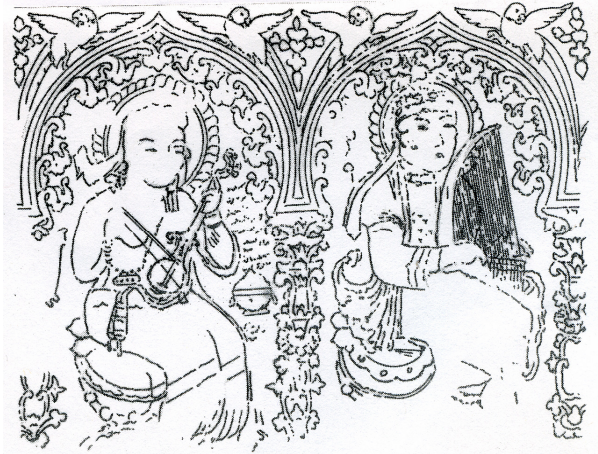
Fig. 1a - Fragment of the mural with the depiction of female musicians