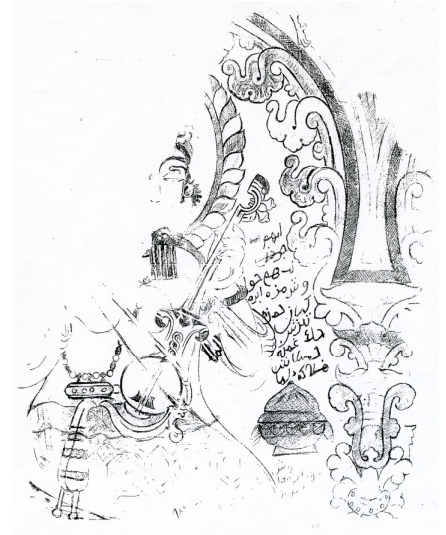
Fig. 3. A kind of rounded block beneath the resonator to which strings could be attached.

(as Gulomova assumed) and according to the second drawing (Fig. 3) it has a kind of rounded block beneath the resonator to which the strings could be attached as well. As far as the second image represents more an artistic interpretation one would rather rely on the first one that is a tracing and could be considered as more accurate depiction. Nuts at the lower part of the body as well as the upper end of the neck are not discernable.